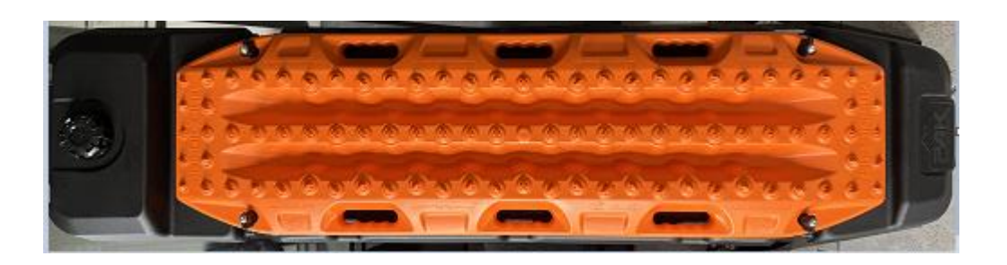
Step 2: Mounting the tank to the Roof Rack:

Your traction boards should look like the image below: